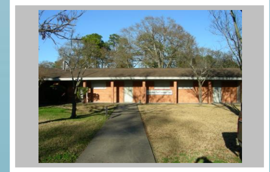
Lillian Beard Deaf Connection Center located in the east wing of the Woodhaven Deaf Baptist Center campus in Spring Branch area.