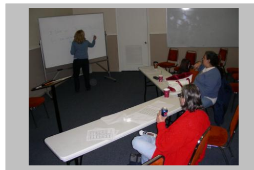
One of our classes at Lillian Beard Deaf Connection Center.

LBDCC is a faith-based deaf-oriented community center that offers various classes, services, social, workshop, and support groups to the Deaf community.